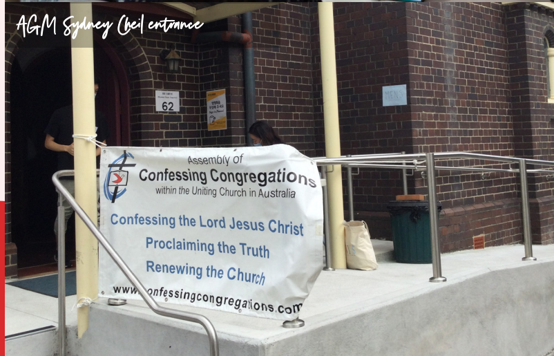
AGM Sydney (Ceil entrance)